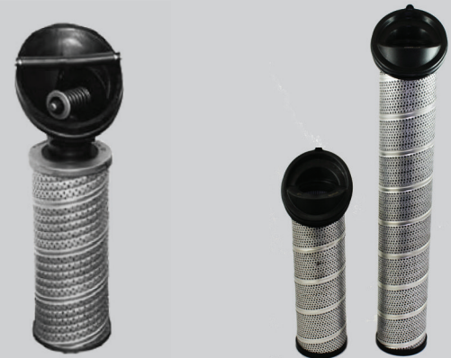
Competitor's Previous 2-Piece Design